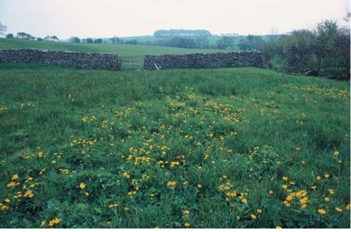
In the Forest of Rowland, local people are directly involved in environmentally friendly farming, delivering biodiversity a

From new beginnings to new opportunities: ahead of us, we see a chance to combine biodiversity with more sustainable rural futures in for public enjoyment will simultaneously increase the sustainability of which farmers produce quality products that include wildlife-rich rural communities. landscape, protecting the best and enhancing the rest. We can also bring more wildlife back into our towns and cities, improving the quality of life,